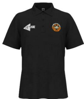
Polo Black VET

VET Shirt from the options below. Students to provide and wear their own black work pants (no shorts or athleisure pants). Students must wear black leather school shoes. Aprons and caps provided.