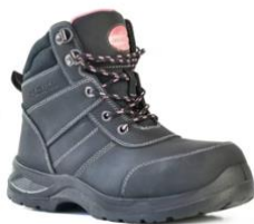
Safety Boot 2