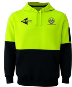
Optional: VET Jumper

Examples of workwear shorts and pants (e.g. from Kmart or Totally Workwear):