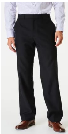
Black Work Pants 2