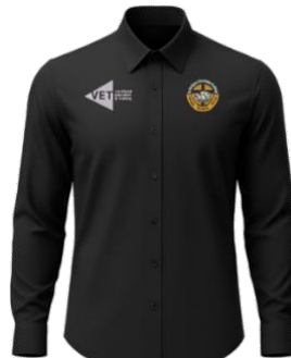
VET Shirt L/S Black

Examples of black workwear shorts and pants (e.g. from Kmart or Totally Workwear):