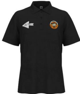
Polo Black VET

*If you are also enrolled in Construction or Electrotechnology, you may wear your Hi Vis Orange or Yellow shirt for Automotive if you do not wish to purchase one of the VET Polo Shirts.