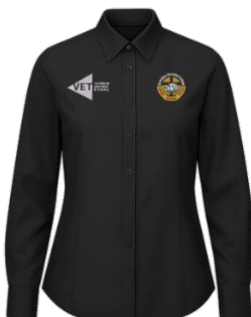
VET Blouse Black