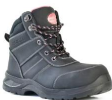
Safety Boot 2