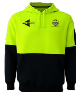
Optional: VET Jumper

Examples of workwear shorts and pants (e.g. from Kmart or Totally Workwear):