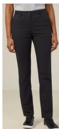
Work Pants 3

Shoes: School Leather Black Shoes only. No sneakers.