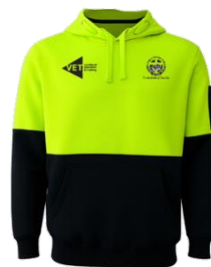
Optional: VET Jumper

Examples of workwear shorts and pants (e.g. from Kmart or Totally Workwear):