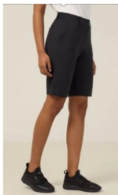
Black Work Shorts