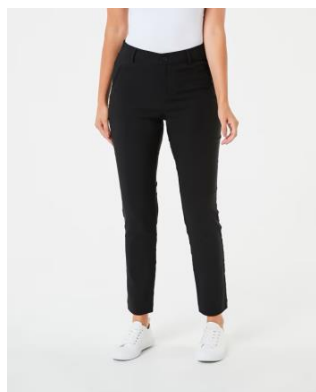
Black Work Pants

Examples of black workwear shorts and pants (e.g. from Kmart or Totally Workwear):