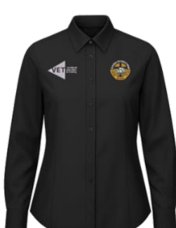
VET Blouse Black